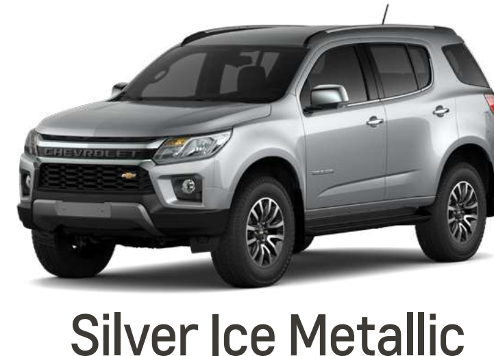
Silver Ice Metallic