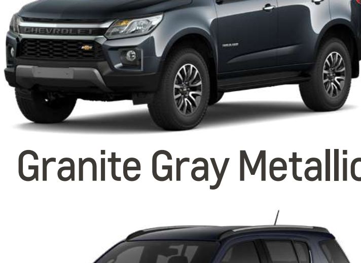
Granite Gray Metallic