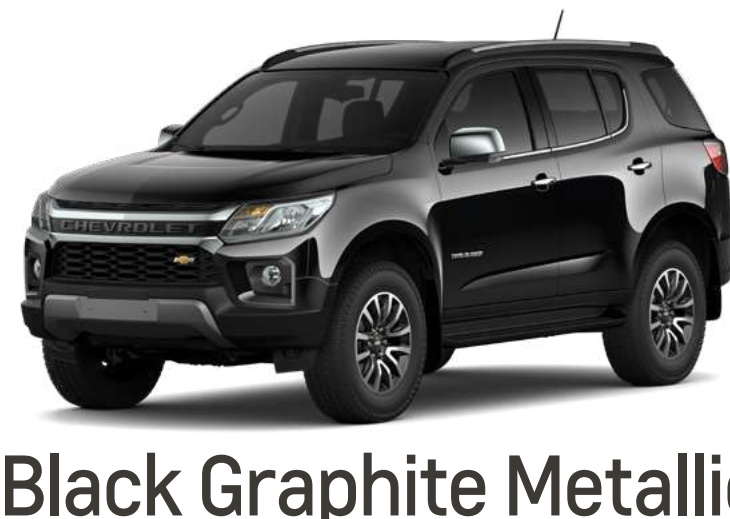
Black Graphite Metallic