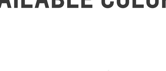
Granite gray metallic