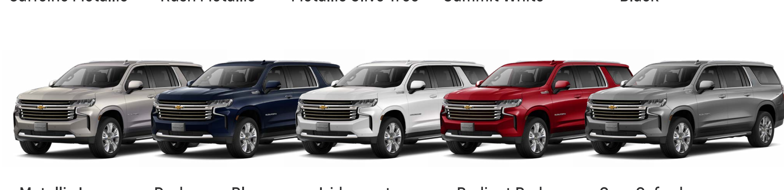
Metallic Ivory Darkmoon Blue Metallic Iridescent Pearl Metallic Radiant Red Gray Oxford

These images are for illustrative purposes only. Please see availability of colors in your country.