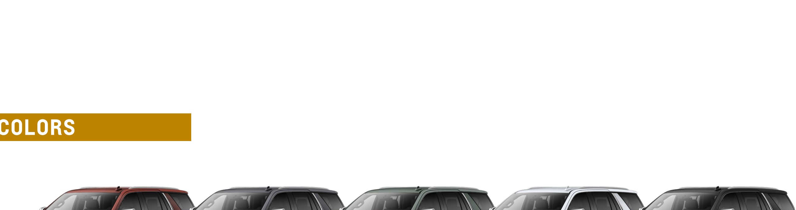
Caffeine Metallic Rush Met Metallic Olive Tree Summit White Black